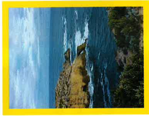
Above: Rugged Coastline carved by the Southern Ocean

The Southern Ocean has been carving impressions for thousands of years where the water meets the mainland . . . Rhino Rock is a result of this natural art; once a part of the mainland and now separated for eternity and resembling a Rhinoceros.