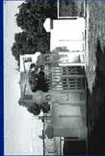
Above: Soldiers Memorial Archway