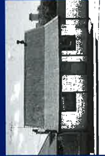
Above: Old Post Office Building

Sadly, a devastating fire in 1959 caused the loss of many of the town's records. It is understood that the Soldiers Memorial Park was developed prior to this, as the Allendale East Soldiers Memorial Archway that welcomes all who visit the Park was opened in 1924. The Soldiers Memorial Archway was constructed to perpetuate the memory of those who died in battle. Money for the construction of the archway was raised from local donations, indicative of the community spirit that remains with the people of the township of Allendale East today.